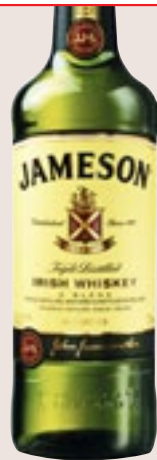
Jameson Irish Whiskey 700ml