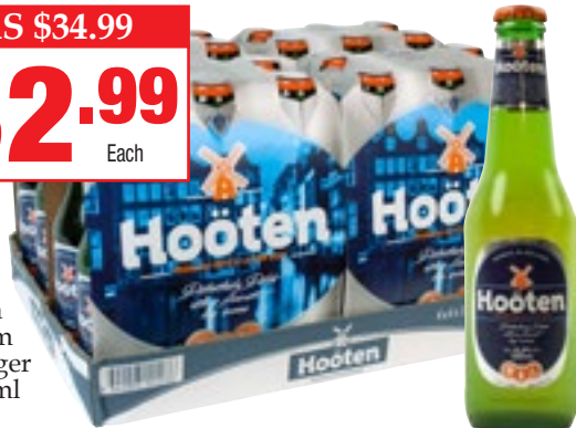
Hooten Premium Dutch Lager 24 x 330ml Bottles