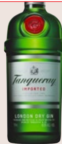
Tanqueray London Dry Gin 700ml