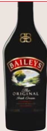
Baileys Original Irish Cream 700ml