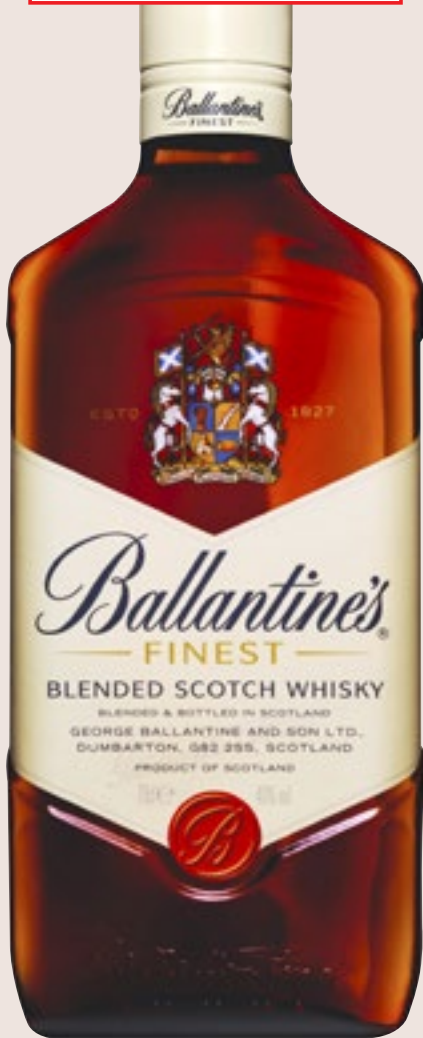
Ballantine's Scotch Whisky 700ml