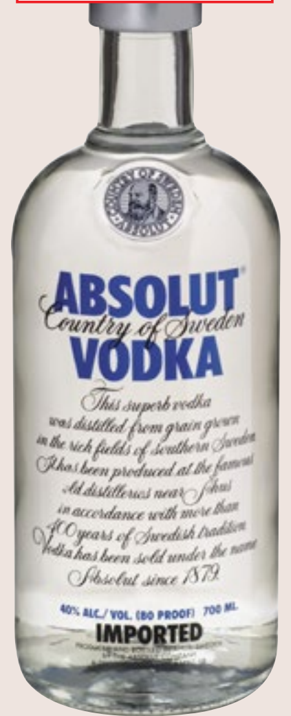
Absolut Vodka 700ml