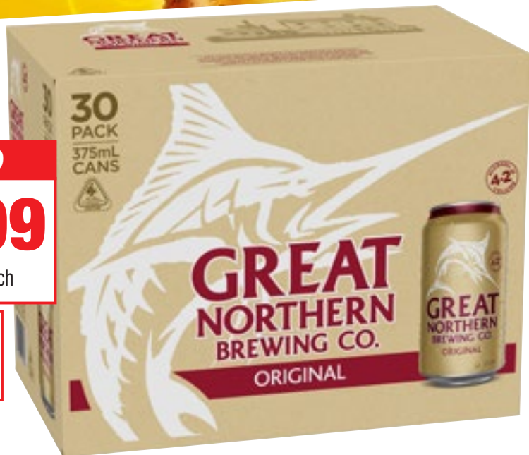
Great Northern Brewing Co. Original 30 x 375ml Cans