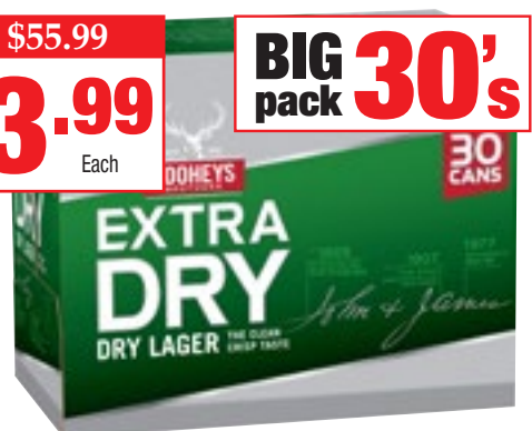
Tooheys Extra Dry 30 x 375ml Cans