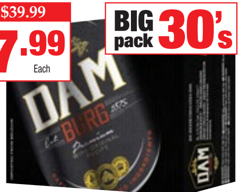
Dam Burg Premium 30 x 330ml Cans