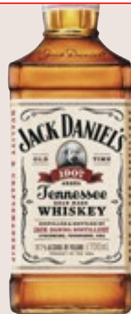
Jack Daniels Whiskey 700ml