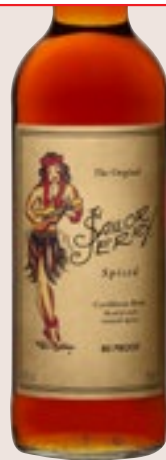
Sailor Jerry Spiced Rum 700ml