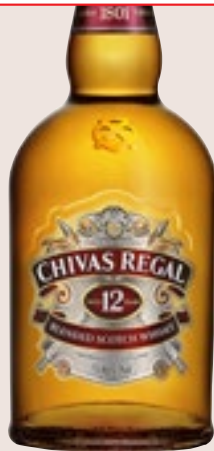
Chivas Regal Scotch Whisky 700ml