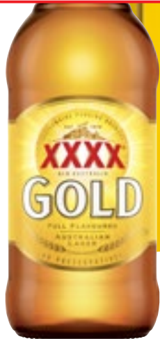
XXXX Gold 24 x 375ml Bottles