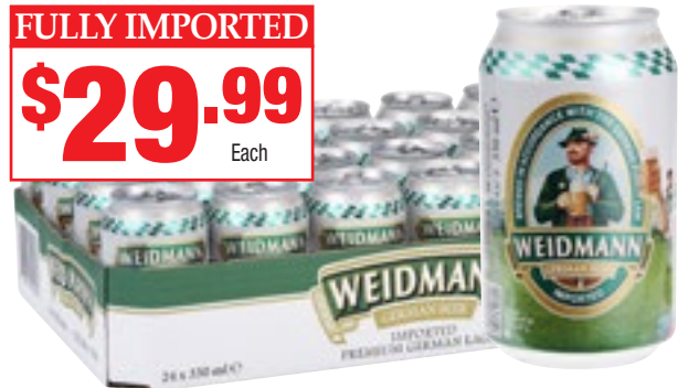
Weidmann German Lager 24 x 330ml Cans

Prices are correct at time of printing. Government legislation may alter prices. We reserve the right to the sale of retail quantities. Images are for illustration purposes only. Some vintages may vary due to early printing schedules. OTHER DISCOUNTS DO NOT APPLY. Specials are available until Tuesday 5th September 2017. We reserve the right to offer an alternative product should we be out of stock for any reason. The Wattle Hotel supports responsible service of alcohol. It is against the law to sell or supply alcohol to, or to obtain alcohol on behalf of, a person under the age of 18 years. I.D. is required if you look under 25 and this is enforced both in our retail store and for home deliveries.