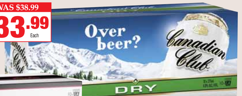
Canadian Club & Dry 10 Pack 375ml Cans