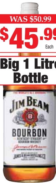
Jim Beam White Label Bourbon 1 Litre