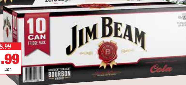
Jim Beam & Cola 10 Pack 375ml Cans