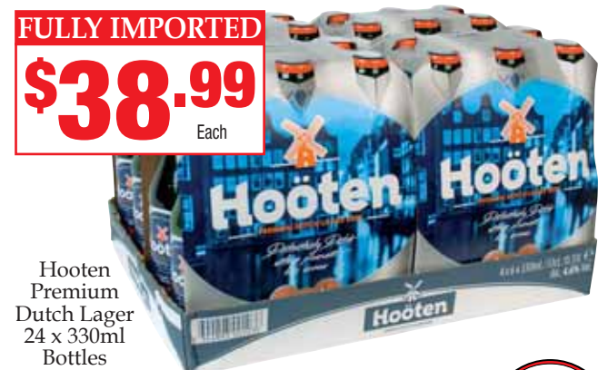
Hooten Premium Dutch Lager 24 x 330ml Bottles

Prices are correct at time of printing. Government legislation may alter prices. We reserve the right to the sale of retail quantities. Images are for illustration purposes only. Some vintages may vary due to early printing schedules. OTHER DISCOUNTS DO NOT APPLY. Specials are available until Tuesday 10th April 2018. We reserve the right to offer an alternative product should we be out of stock for any reason. The Wattle Hotel supports responsible service of alcohol. It is against the law to sell or supply alcohol to, or to obtain alcohol on behalf of, a person under the age of 18 years. I.D. is required if you look under 25 and this is enforced both in our retail store and for home deliveries.