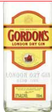
Gordon's London Dry Gin 700ml