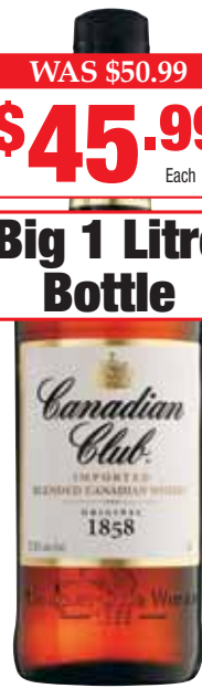
Canadian Club Blended Whisky 1 Litre