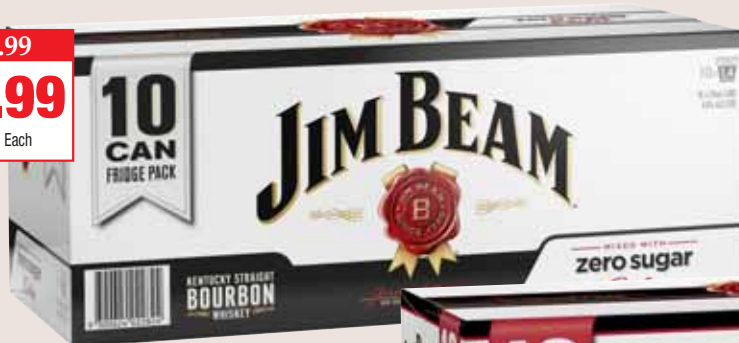
Jim Beam Zero Sugar Cola 10 Pack 375ml Cans