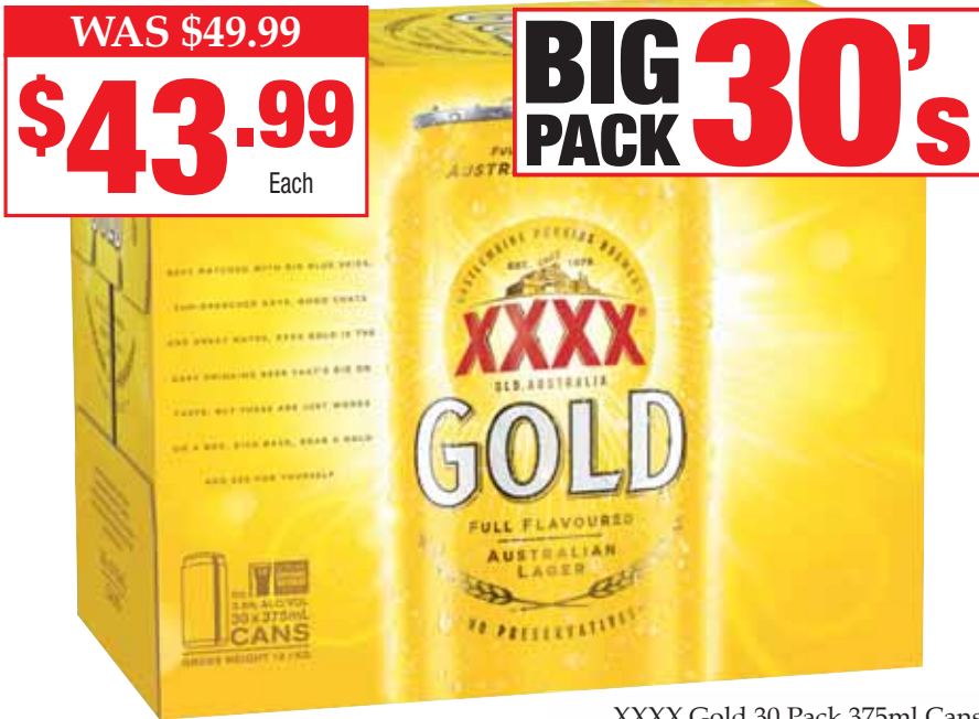
XXX Gold 30 Pack 375ml Cans