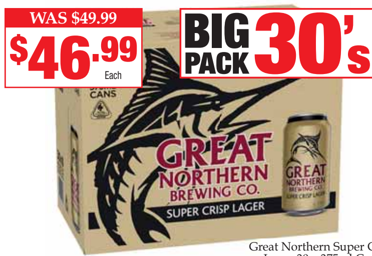
Great Northern Super Crisp Lager 30 x 375ml Cans

Buy a single bottle for only $3.99 Purchase a dozen for $40.00 and save $31.88.