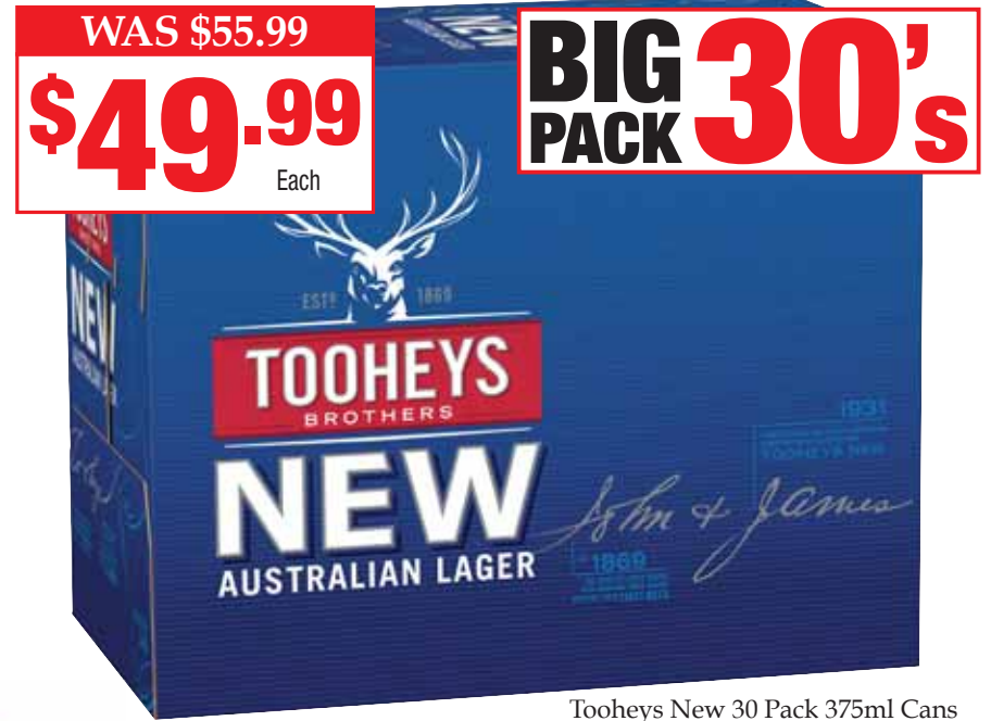
Tooheys New 30 Pack 375ml Cans