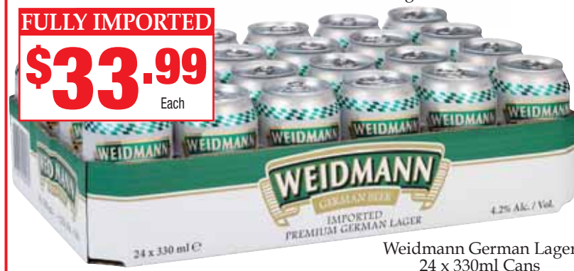
Weidmann German Lager 24 x 330ml Cans