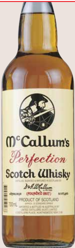
McCallums Perfection Scotch Whisky 700ml