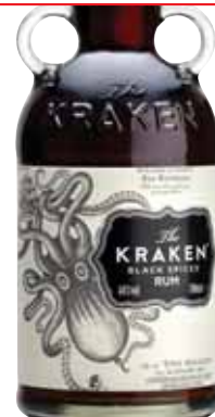
The Kraken Rum 700ml