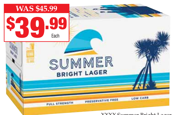
XXX Summer Bright Lager 24 x 330ml Bottles