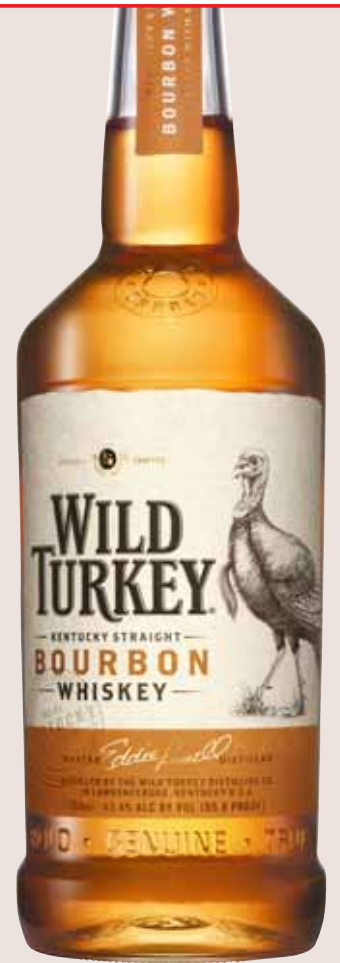
Wild Turkey 86.8 Proof 700ml