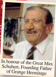
In honour of the Great Max Schubert, Founding Father of Grange Hermitage

Penfolds have produced this range in honour of the legendary Max Schubert their brilliant red winemaker who invented Grange in the 50s and put the Penfold brand on the world stage as a premium producer. They released them in 2015 on what would have been his 100th birthday, he sadly passed in 1994, though we are pretty sure you know Max's story. This Shiraz Cabernet shows all, and we assure you all of the characteristics that have made Penfold's reds famous with a twist - it is ready to drink right now, it is at its peak, from "shelf to glass" as they say.